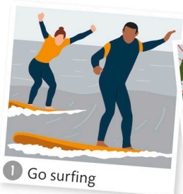
1 Go surfing