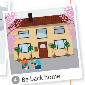
4 Be back home