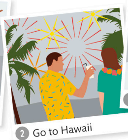
2 Go to Hawaii